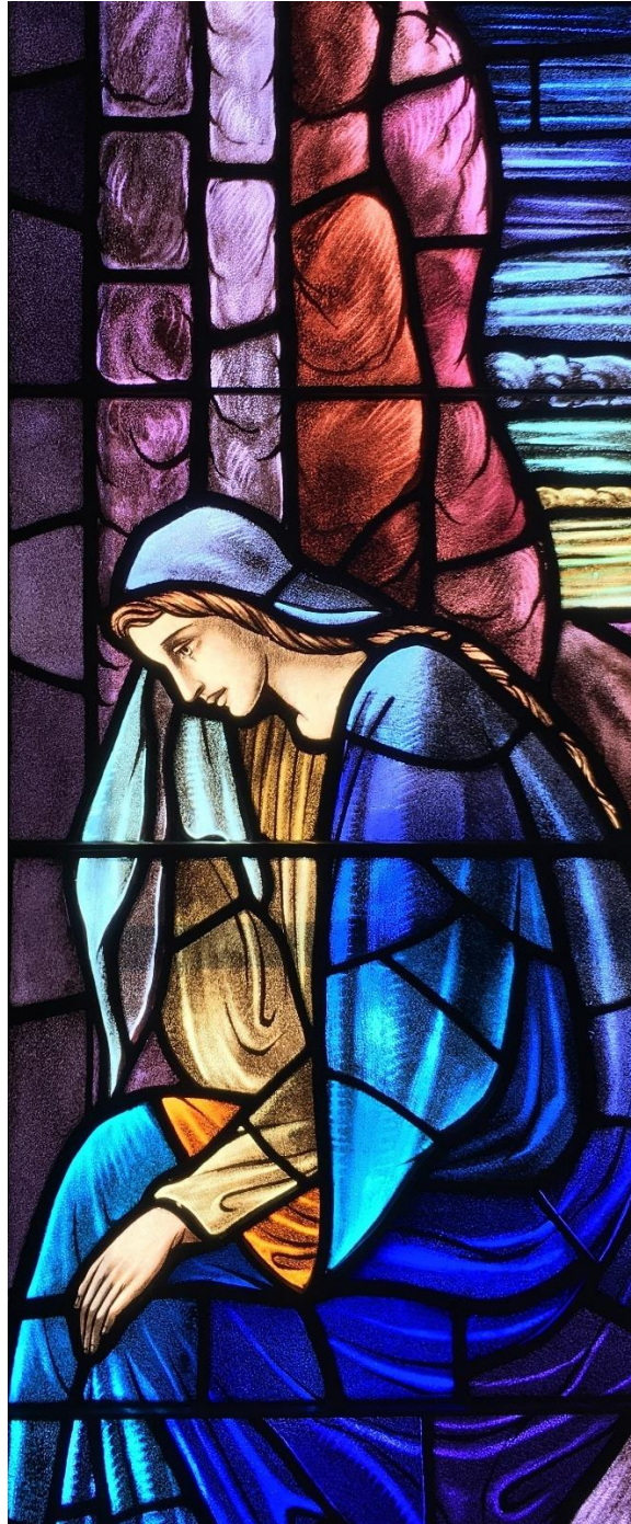
Detail from In the Garden (1958), New St. James